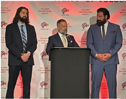
CONGRESSMAN CORY MILLS