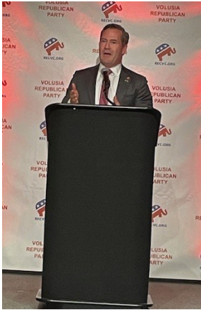
CONGRESSMAN MICHAEL WALTZ