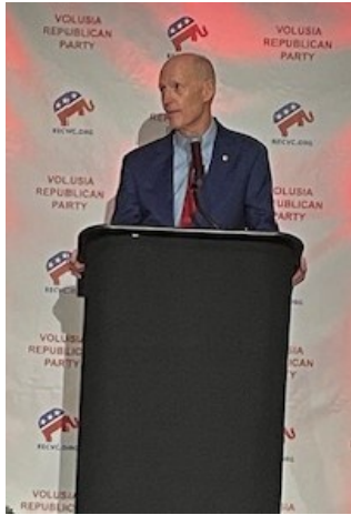
KEYNOTE SPEAKER US SENATOR RICK SCOTT